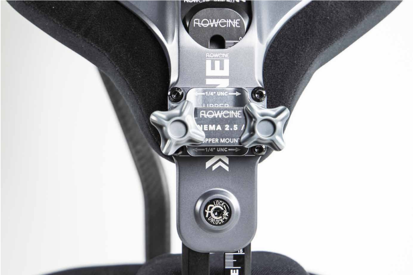
Easyrig Cinema 2.5 / 3 INSTALLATION